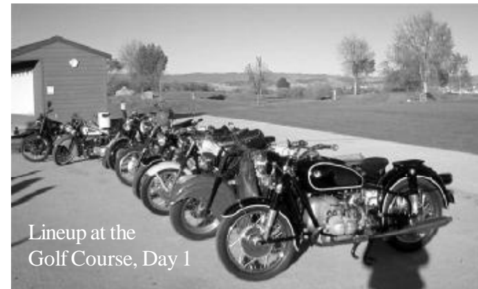
Lineup at the Golf Course, Day 1