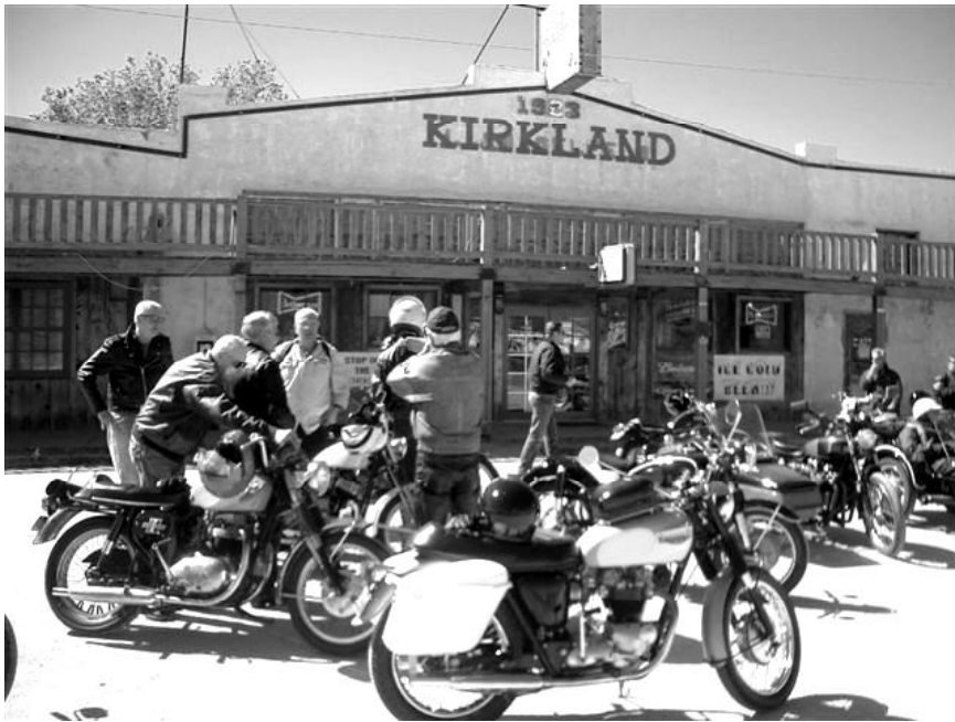
Group stop at Kirkland Junction on the way to Bagdad Mine