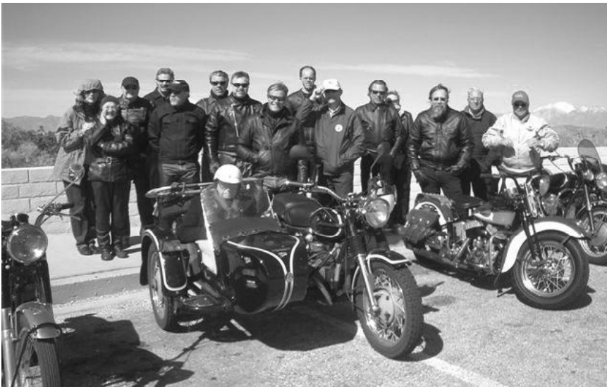
Group Photo at Keyes Point, Joshua Tree National Park