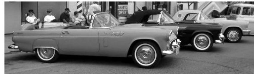
T-Birds on Display in Perris

All of those in attendance had a fun time; here's hoping to see more of our members in attendance next year, but thanks to all who participated.