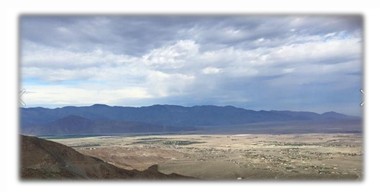
What a beautiful view and ride!